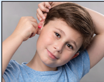
Pull back and insert