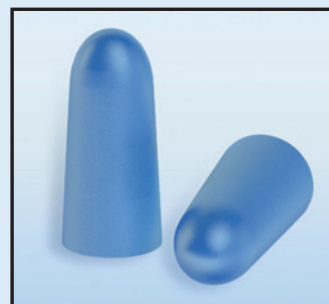
Formable foam earplugs

Wearing earmuffs and earplugs together can further reduce sound, which is great for very noisy environments like woodshops and shooting sports events.