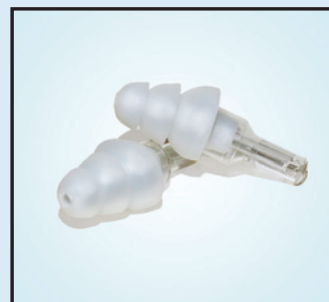
Pre-molded, high-fidelity earplugs