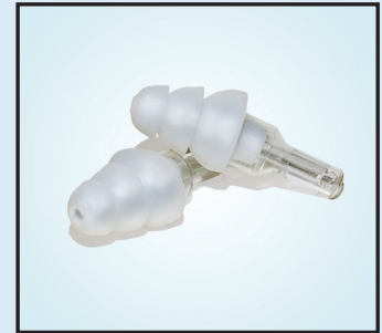
Pre-molded, high-fidelity earplugs