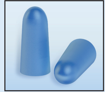
Formable foam earplugs

Wearing earmuffs and earplugs together can further reduce sound, which is great for very noisy environments like woodshops and shooting sports events.